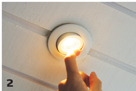
2 Grasp the inside of the lamp and pull out the front.