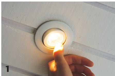
1 Tilt the light source.