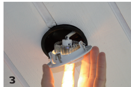
3 Now the lamp is hanging loose.