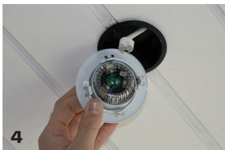
4 Release the light source from the socket.