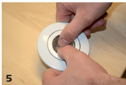
5 Press the light source out of the front.